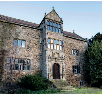
Grade I listed - Gainford Hall