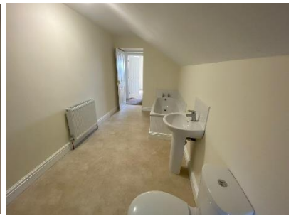
Price on Application