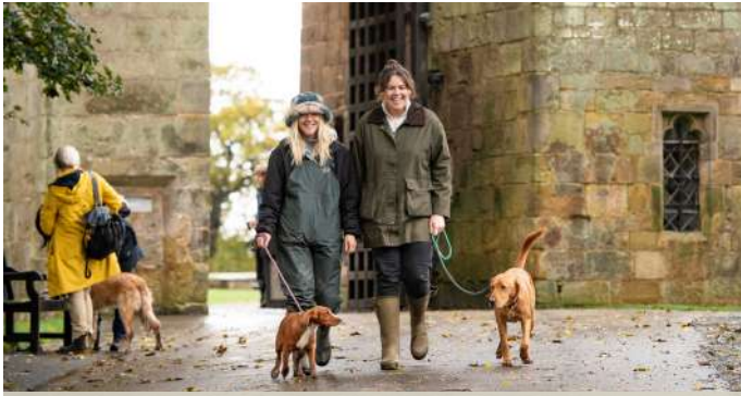
The Great British Dog Walk Raby Castle Sunday 5th May