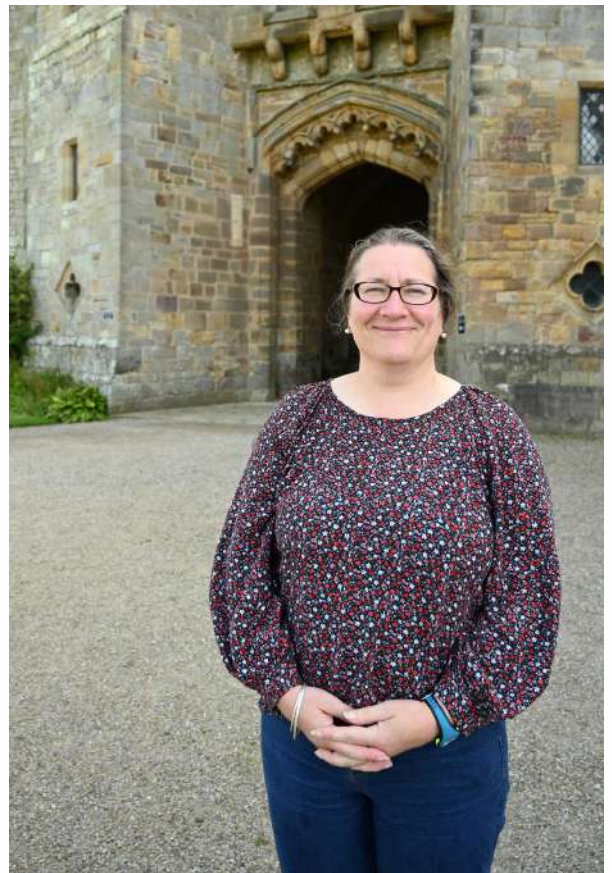
Sustainability Manager, Victoria

All this information should provide a good baseline for monitoring change and helps us to understand how we can improve our performance in future years.