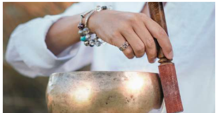
Morning Meditation and Sound Bath Raby Castle Saturday 25th May