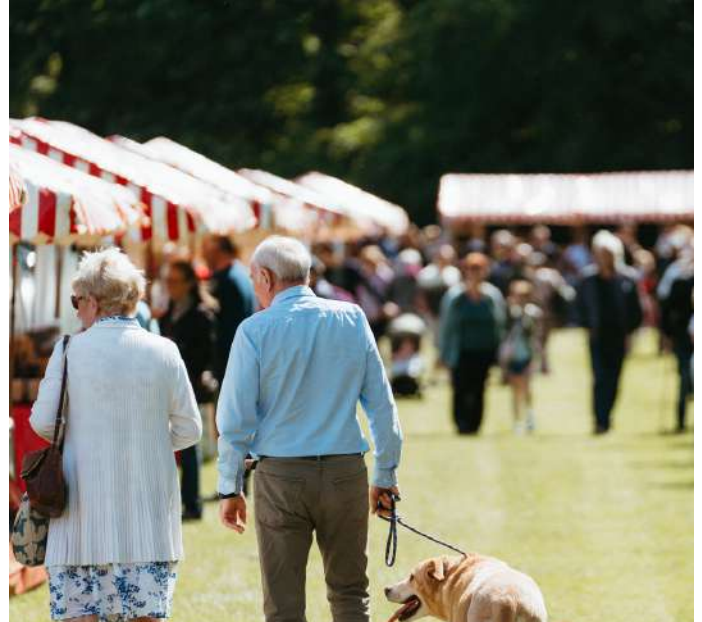
Spring Seasonal Market Raby Castle Saturday 27th - Sunday 28th April