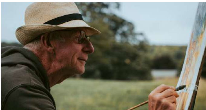
Landscape Painting Workshop Raby Castle Saturday 1st June