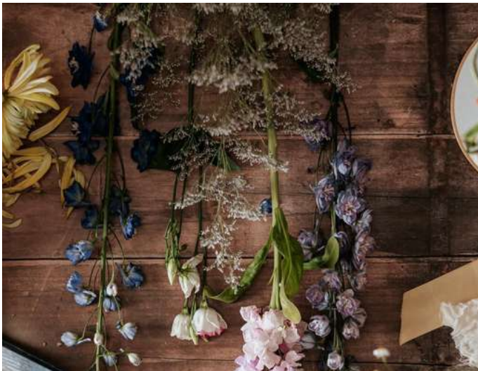
Spring Floral Workshop Raby Castle Saturday 18th May