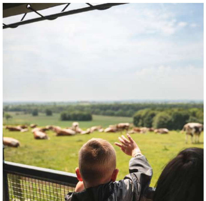
Open Farm Sunday Raby Castle Sunday 9th June