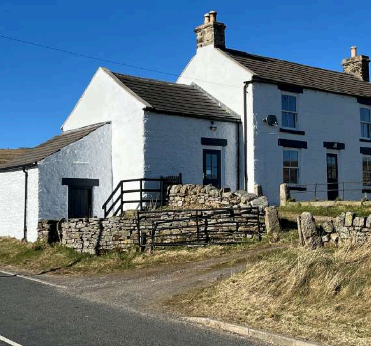
Rough Rigg in Harewood